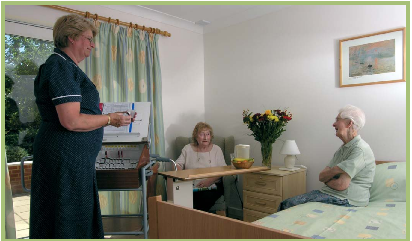
Intermediate Care Room

At Springfield our Intermediate Care unit of 10 beds is funded as part of the NHS, with the aim of providing short term intensive care and support. Our staff work in full partnership with NHS nursing, medical and therapy practitioners and Local Authority Care managers, to meet the individual needs of patients. The aim is to ensure seamless care, between hospital and home and we therefore work closely with hospital services and the Primary Care teams of GP's and District Nurses.